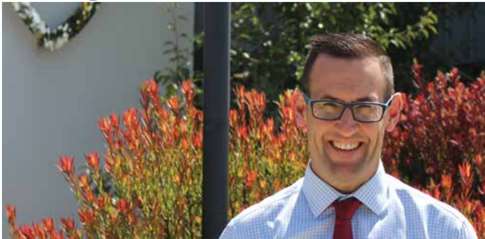
Ping. Pong. Ping. Pong. Back and forth it goes.

Although you'd be forgiven for thinking this is an Olympic-themed message inspired by watching table tennis in recent days, it's more a reference to the to-ing and fro-ing of our current COVID-impacted lives. One moment we were embracing the opening days of a new term, then in an instant we were plunged into uncertainty.