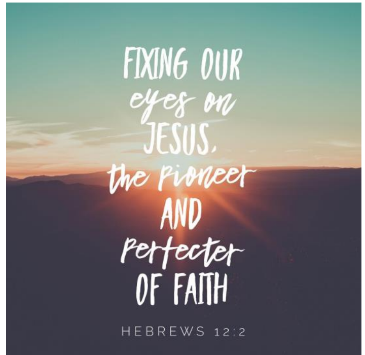
image of the perfecter, with ever increasing glory, so that we can win this race.

Jesus is the "Pioneer" in that he has made the path possible, in fact, He is the path. By enduring the cross, Jesus paid the price for our sins and made it possible for us to run to God. Before this, our sin disqualified us from even running the race. This reminds us that it is not our works that allow us to run this race, but His grace. He is the "perfecter" in that he is transforming us, evermore, with ever increasing glory, into elite athletes able to run with endurance. Before this, we were weighed down with the burden of sin and death, but through His death on the cross and His resurrection we have been set free from sin and are being transformed into His image, the