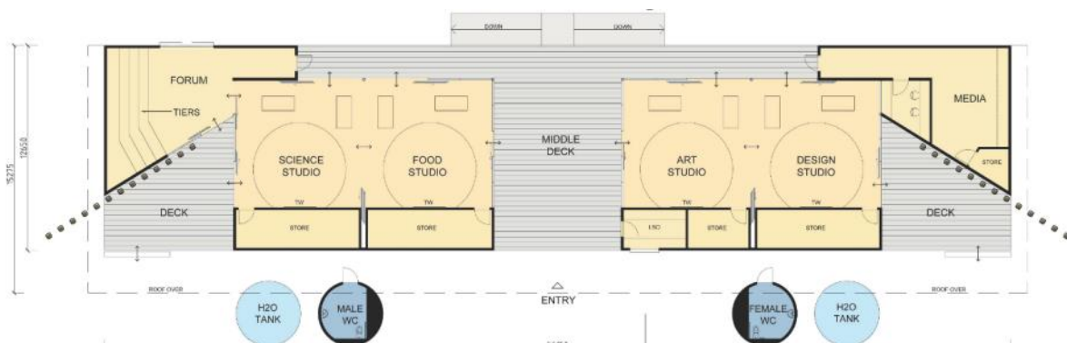
PICTURED: Encounter's new Middle School Learning Centre currently under construction on Block 69

As the EOCD Future of Education and Skills Working Group states, "we need to prepare students for jobs that have not yet been created, to tackle societal challenges that we can't yet imagine, and to use technologies that have not yet been invented" . Explicit teaching of critical and creative thinking, experiential project-based learning in state-of-the-art learning spaces in our Middle School underpins Encounter's commitment to ensuring our learners are best prepared for the challenges ahead. As we move into the middle of what is a very busy Term 4, I wish you every blessing for the weeks ahead.